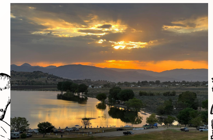
FRIDAY: BRITE LAKE FIELD TRIP

EMBARK ON AN ADVENTUROUS EXPLORATION AS THIS YEAR'S SUMMER CAMP TAKES CAMPERS ON AN EXCITING JOURNEY TOURING TEHACHAPI, CA. TEHACHAPI OFFERS A UNIQUE BLEND OF NATURE, HISTORY, AND OUTDOOR ACTIVITIES. CAMPERS WILL DISCOVER THE CHARM OF THIS SMALL TOWN. THE TOUR INCLUDES VISITS TO LOCAL ATTRACTIONS SUCH AS DOWN TOWN TEHACHAPI, BRITE LAKE, AND THE TEHACHAPI DEPOT RAILROAD MUSEUM, WHERE KIDS CAN DELVE INTO THE RICH HISTORY OF THE AREA. THIS TEHACHAPI EXPEDITION AT SUMMER CAMP PROMISES AN IMMERSIVE EXPERIENCE, FOSTERING A CONNECTION WITH NATURE, LOCAL CULTURE, AND THE JOY OF EXPLORATION.